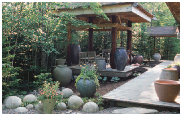
Pottery factory or Zen retreat? The grounds at Lunaform.

Thirty-plus years after seeing the movie I visited the Thuya Garden above the Asticou Inn in Northeast Harbor. Set among the flowerbeds was a pot large enough to hold a thief—a short and relatively skinny thief, but a thief nonetheless.