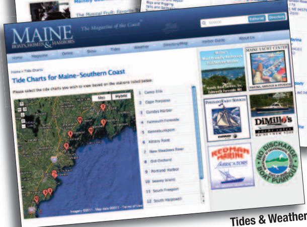
Tides & Weather

Maine Boats, Homes & Harbors, P.O. Box 566, Rockland, ME 04841