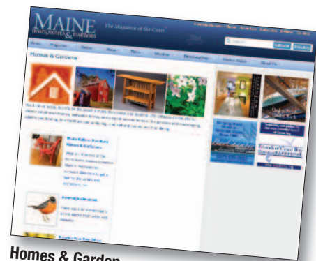
Homes & Garden

Run of Web display ads start at just $162.50 per month!