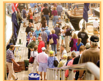
2008 MBH&H Show.